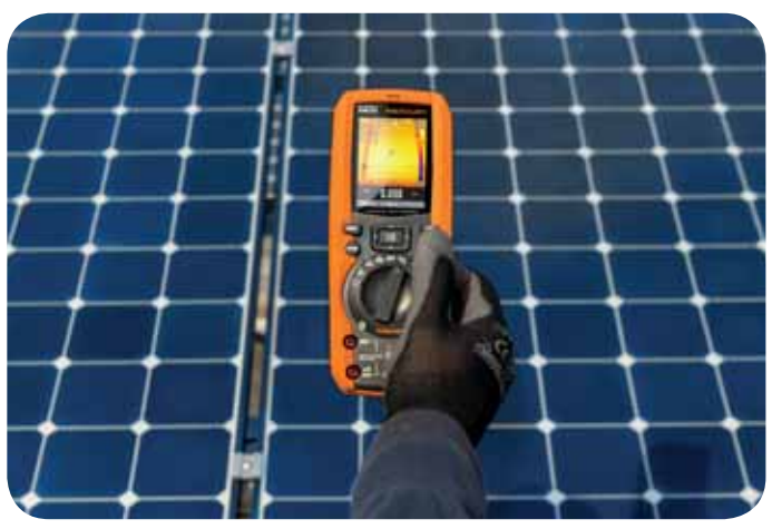
PV field thermography.