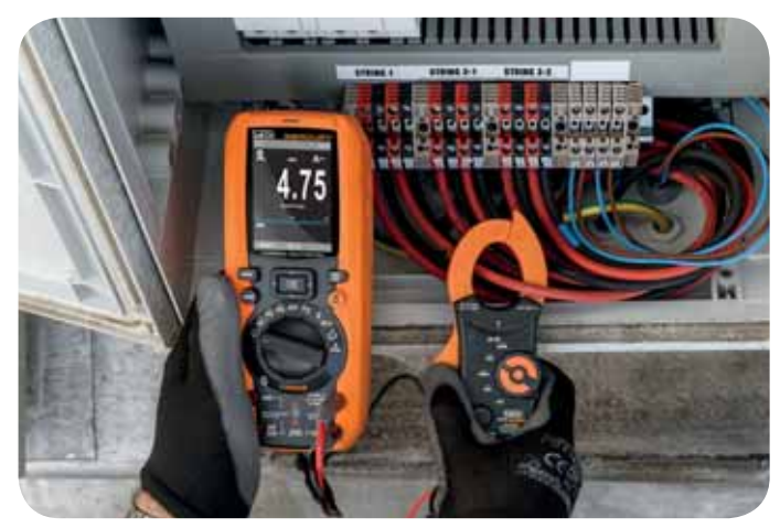
PV string Impp measurement.