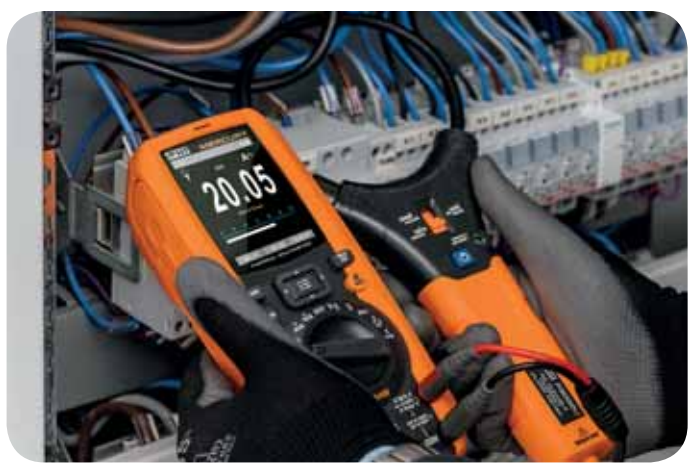
AC current measurement.