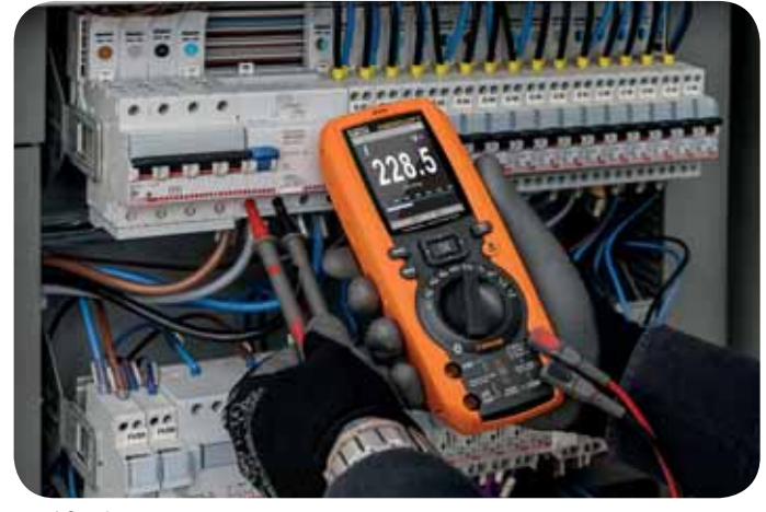
AC voltage measurement.