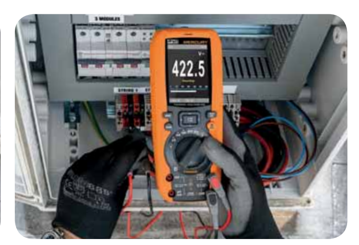
PV string Vmpp measurement