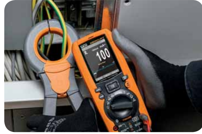
AC leakage measurement.