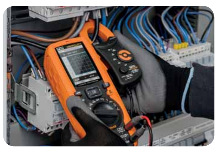
AC+DC current recording.