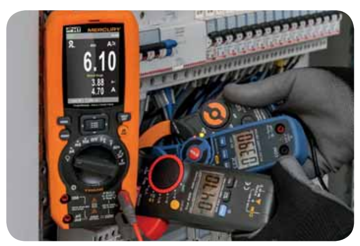
AC+DC current measurement comparison: 3.9A with RMS clamp, 4.7A with TRMS clamp, 6.1A with AC+DC TRMS clamp.