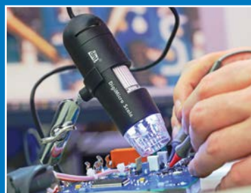
Onderhoud, reparatie en kalibratie